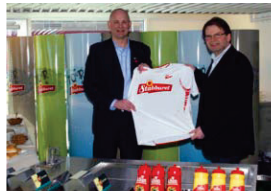
Above: the presentation of the jersey of the Fredrikstad F.K. football club, sponsored by Stabburet.