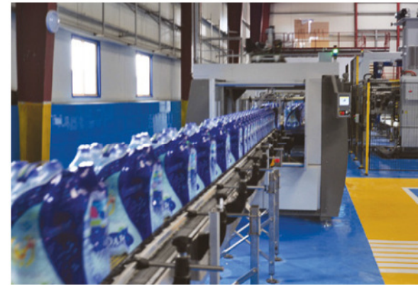
The bundles to the APS ERGON series' palletizer (SMI).

The image of the logo, that reproduces the typical Berber mau-