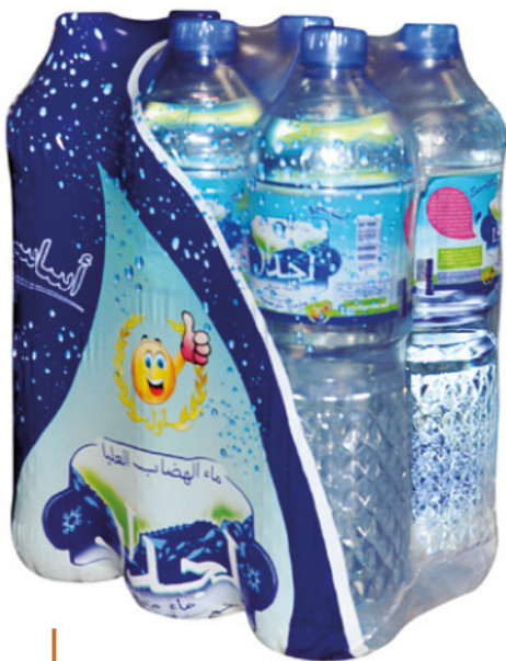
Natural spring water Lejdar brand of Tousnina.

The solution installed consists of an ECOBLOC® ERGON series' integrated system for stretch-blow moulding, filling and capping of PET bottles along with an SK ERGON series' shrink wrapper for the secondary packaging, a HA 80 handle applicator, a PACKSORTER pack divider-sorter and an APS ERGON series' palletizer. The whole plant is equipped with an automation and control system of the latest generation incorporating the best technologies for the management of a "smart factory."