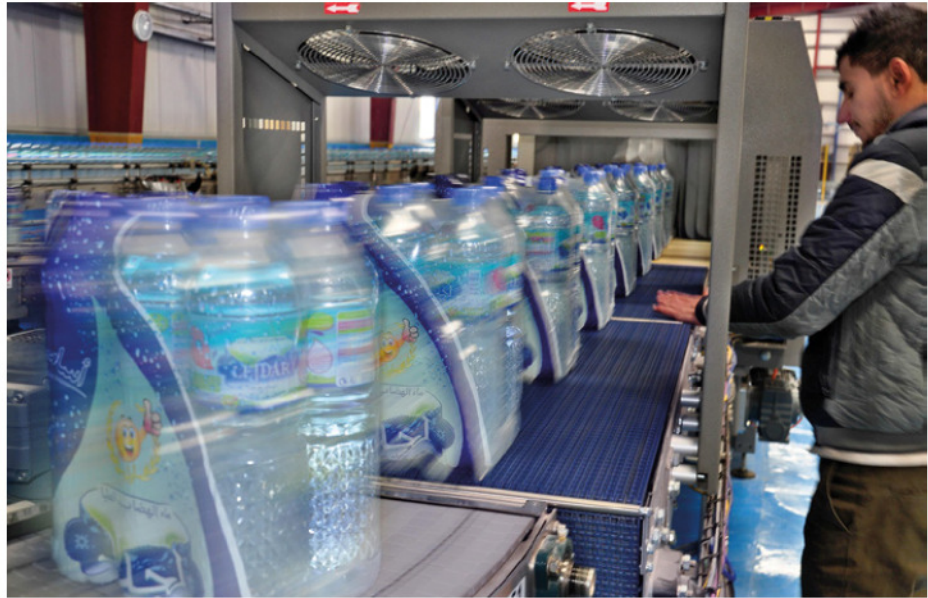
SK ERGON series' shrink wrapper (SMI).

For the bottling and packaging in PET bottles of the natural spring water under the Lejdar brand Tousnina Sarl turned to the experience of SMI , which supplied a complete turnkey line of 20,000 bottles/hour