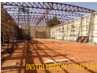
INSTALLATION / Safi Sarl