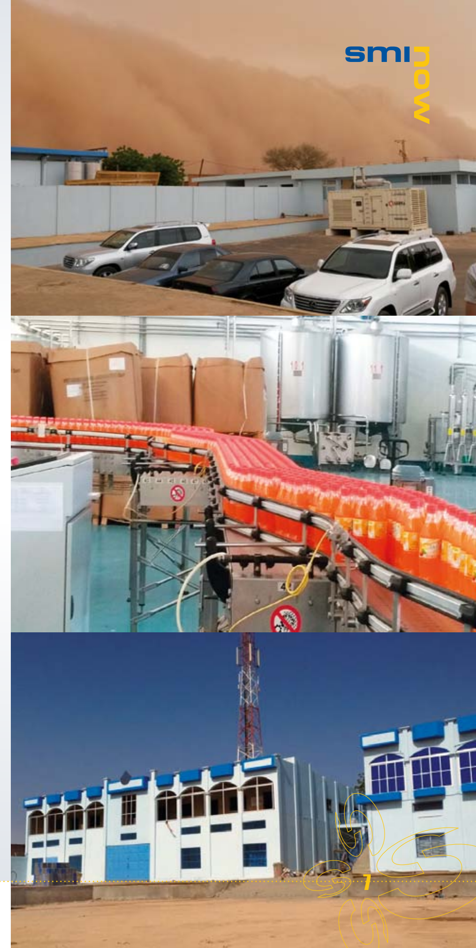
INSTALLATION / Safi Sarl