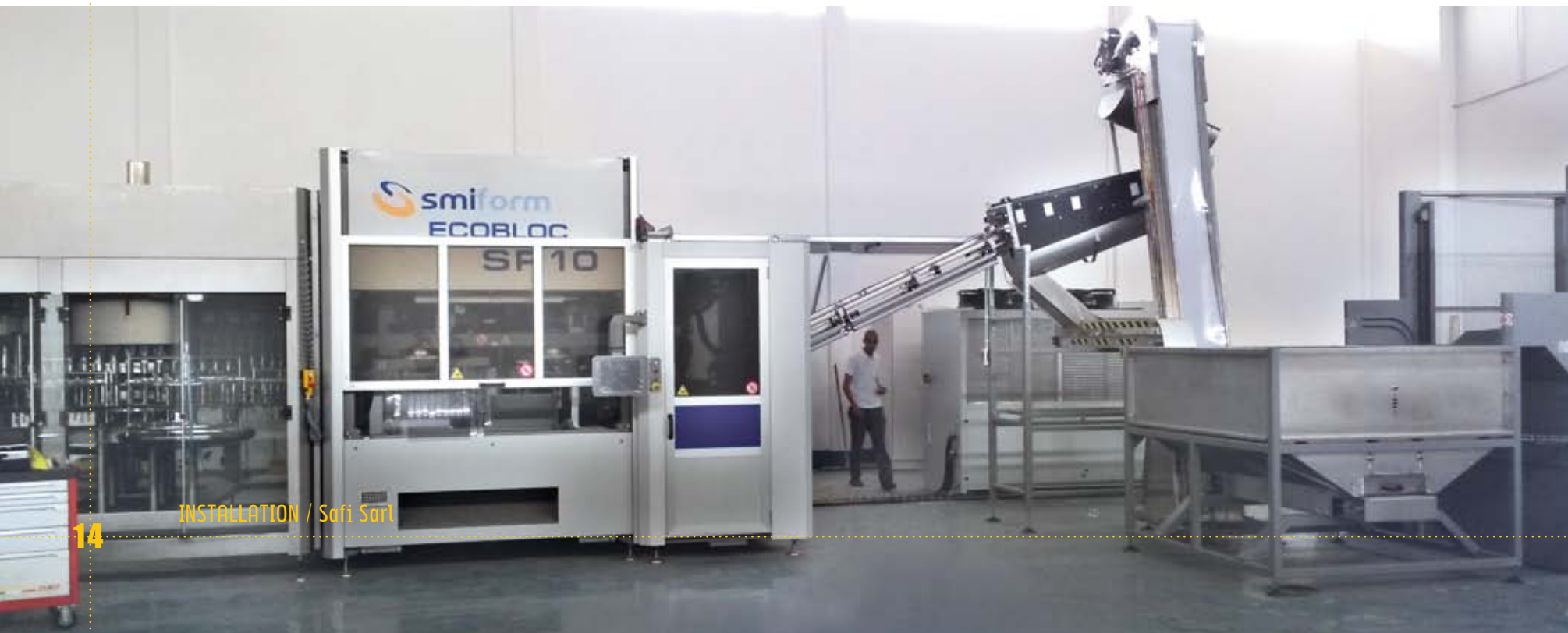
INSTALLATION / Safi Sarl